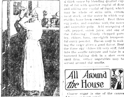
The Telephone Is Indispensable in the Rural Home.

Prepared by the United States Department of Agriculture. One of the principal reasons for getting telephone service in rural communities, where frequently a small municipal company may be formed to have such service at all, is the necessity of switchboard service. There are several ways of managing this necessary function without undue cost.