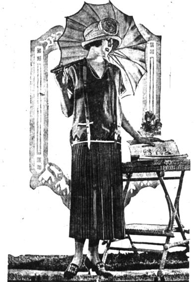
PLAITED SKIRT FOR SPORTSWEAR

The plaited skirt, of silk or wool crepe, has reached the point where it goes without saying that it is the favorite style for summer sportswear. "Sports wear" includes far more than things for actual sports; a world of informal but smart clothes, comfortable and pretty, but having a casual character, are classed under this title and are seen everywhere and any time, for all sorts of out-dooring.