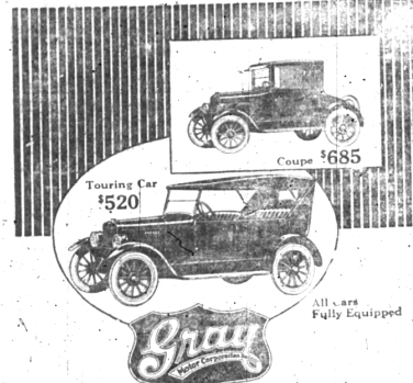
Touring Car $520 Coupe $685