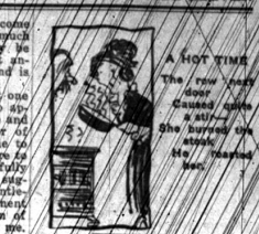
A HOT TIME