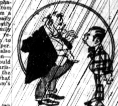
A SERIOUS MATTER