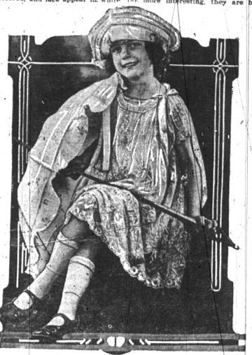
A PRETTY PARTY FROCK