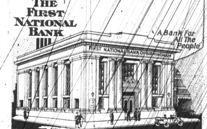
THE FIRST NATIONAL BANK. A Bank For All The People.

A post card, a phone call or a visit brings you full particulars.