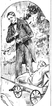
"You Lead the Way," Cried the Child; "You and Mrs. Hunchberg."

Moldavia. He walked stepped on your train—Sashay All!