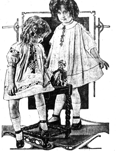
TWO FROCKS IN PLAIN FABRICS