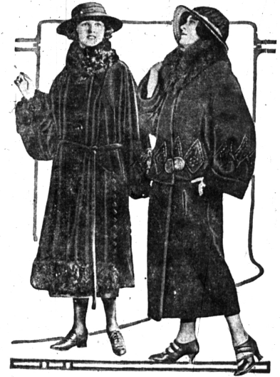
TWO MODELS THAT OFFER SAFE INVESTMENT