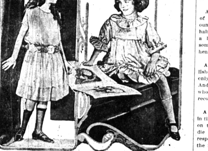
TWO TASTY PARTY FROCKS FOR CHILDREN

Dark colors, as black and brown in crepe satin are trimmed with multi-colored embroideries and have linings in bright colors repeating one of the colors in the embroidery.