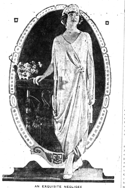
AN EXQUISITE NEGLIGEE