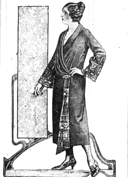
EXPERT DESIGNING IN SPRING FROCKS

home and announces that "all the girls are wearing" this or that, it amounts to an ultimatum to the family. Father forthwith proceeds to get out his check-book or mother takes inventory of the contents of her purse. Fortunately, schoolgirls are showing an excellent vision of that they are making handsome jersey-knit slipovers and mannish sweaters the objects of their exploitation for midseason wear. It is a rigid test of conservatism which these knitted garments must pass in order to qualify. Strictly pure wool is the first requisite—and they must be correctly detailed in proper neckline,