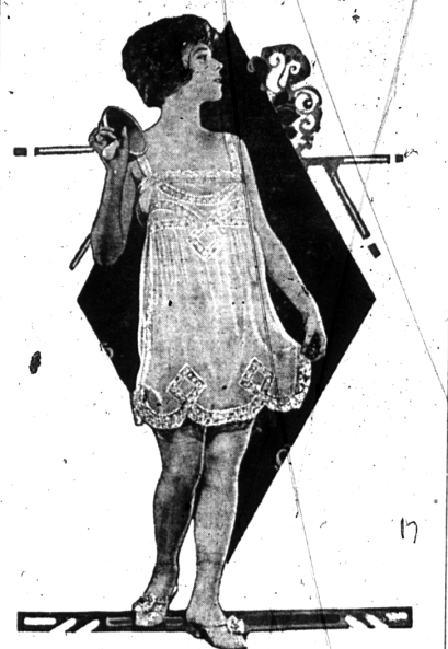
PRETTY ENVELOPE CHEMISE

IF THE replenishing of undergarments which is stressed in the shops with the beginning of the year, is not yet completed, Lent gives an opportunity to needlewomen to finish up the work. Styles are important and are established. Buying has shown that radium and crepe de chine had the preferred dials, batiste and triple voile of favored cottons and pastel colors as much in demand as white. One may