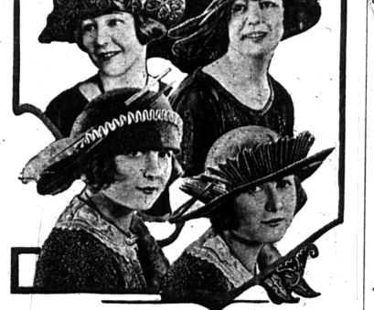
GROUP OF SPRING HATS

into it. It is handsome in any of the fashionable colors, "strawberry," "blue bell," brown, reseda or in which a smart bunch of burnt peacock springs. A charming development of the poke is trimmed with very wide ribbon and accent. A turban at the lower left contains itself with two soft curls and a pretty ribbon trim and next to it a modified Breton employ wide ribbon lavishly, folded into points and set about the crown.