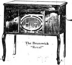
The Brunswick "Royal"

The Sign of Musical Progress Brunswick PHONOGRAPHS AND RECORDS