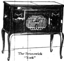
The Brunswick "York"

Regardless of the size of your pocketbook there is a Brunswick Phonograph for you