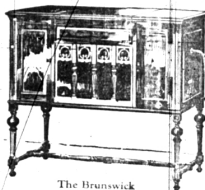
The Brunswick "Raleigh"