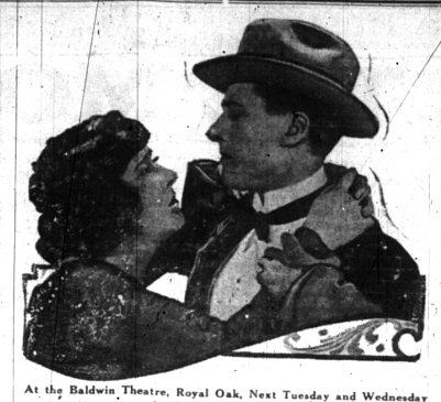
At the Baldwin Theatre, Royal Oak, Next Tuesday and Wednesday