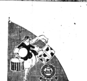
The "Sport-Dress" Oxford