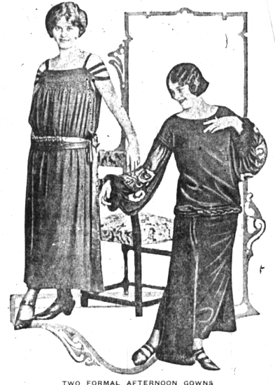
TWO FORMAL AFTERNOON GOWNS

STRAIGHT line and draped dresses that contribute their part toward "general" and "specific" of home laundry workers one-quarter and of dressmakers in the home nearly one-half. Unlike previous advanced civilizations, our own flourishes without a constant increase in the numbers of the serried class, says the Youth's Companion. The reason of course is the extent to which machines have come to do the work of hands.