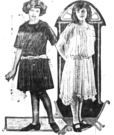
TWO PRETTY FROCKS FOR JUNIORS

made clothing or to take the styles shown in the shops as guides and copy them in home-made garments. Any girl, from eight to fourteen, will like the frock of velvet shown at the left of the picture. It is especially smart in blue or brown, with its round neck and elbow sleeves outlined with three rows of very narrow silk braid in vivid shades of bright color.