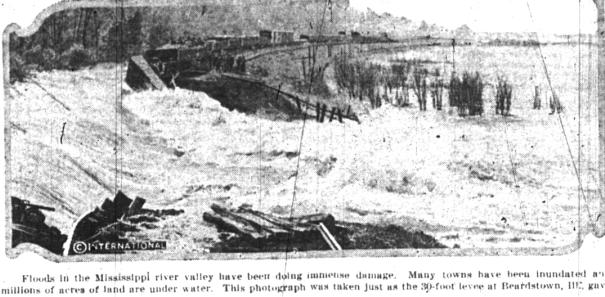
Floods in the Mississippi river valley have been doing immense damage. Many towns have been inundated and millions of acres of land are under water. This photograph was taken just as the 30-foot levee at Beardstown, Ill., gave way.