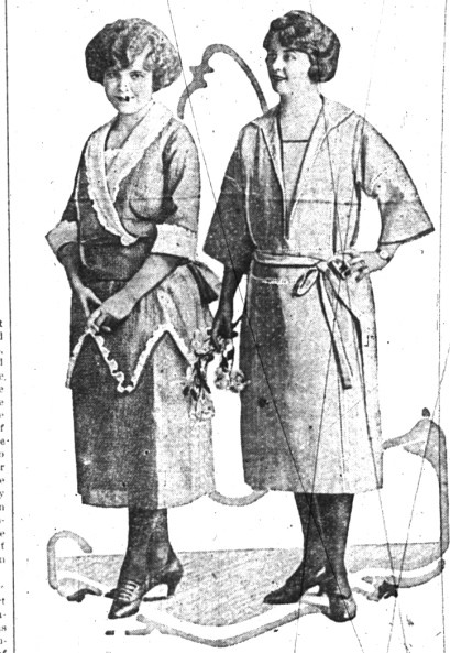
CUTE AFTERNOON DRESSES OF ORGANDIE

SUMMER has brought in some new cotton frocks that aim to please by being as much like their forerunners of the winter as cotton can be like silk. They are trailing along in the wake of their next-of-kin, the silk crepe, and are an honor to the family, with their soft texture and delightful colors. Cotton kasha cloth, and other weaves, are proving their worth, especially in those straight-line dresses with neat and strange decorations. But along with these come the fabrics that mean summer to us: the