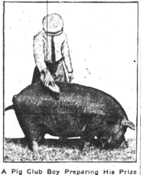
A Pig Club Boy Preparing His Prize Winner for the Ring.

Began Work Early. These boys and girls do not wait until ready to go to high school or college before starting their club work and savings. Some began two, three, or more years before, or, as one boy said, as soon as he could, meaning 10 years—the youngest age at which children are admitted to the clubs. Two girls of Mobile, Ala., with a flock of chickens began their savings three years ago. In Georgia a number of club girls have started "go-to-college funds." They put the money realized from the sale of their chickens, which are mostly fancy packs of pre-