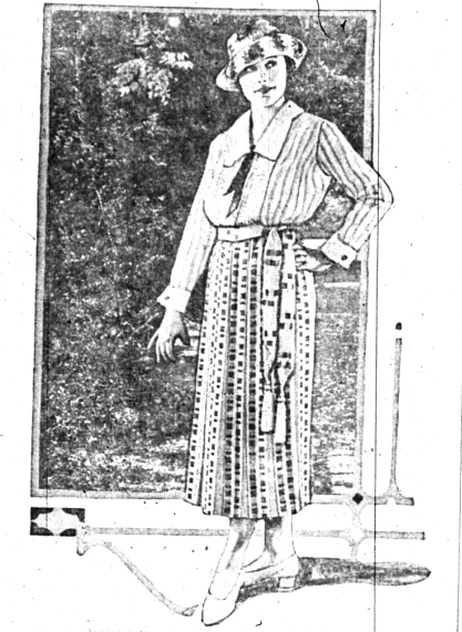
HANDSOME SKIRT IN WHITE AND BLACK

IN SEPARATE skirts for sports and smartness, the demand has swung round to white or patterns in which white dominates. Whatever the material, whether silk, wool, linen or cotton, the skirts of the hour emphasize all-white or white with fine cross-stripes or hair-line stripes that make little impression of color.