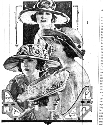
MIDSUMMER HATS HAVE WIDER BRIMS

they launder easily and nothing looks quite so cool and crisp, unless it be a well-balanced combination of black and white. The active sportsman likes white, revealing superb workmanship. Crowns of linen or white flannel when she plays are usually round in both fabric and tennis, white or otherwise enjoys the white, with cross-hatched and beading of orange for blue or green. Orchestral, pearl gray, almost black with a sweater in matching color, and brown called "amateur" are made for a dresser model she might well select white crepe or a combination of white and black like the handsome skirt pictured. These silk skirts, one fabric model and one combining both straw and white the wrap-around and plain fabric, compose the group pictured here. A very wide-shouldered hat with white tulle at the top, has its brim swathed with a twisted mill of orchid velvet and a huge shawl of velvet and georgette mounted at the front of the crown. The lovely and intricate leg-