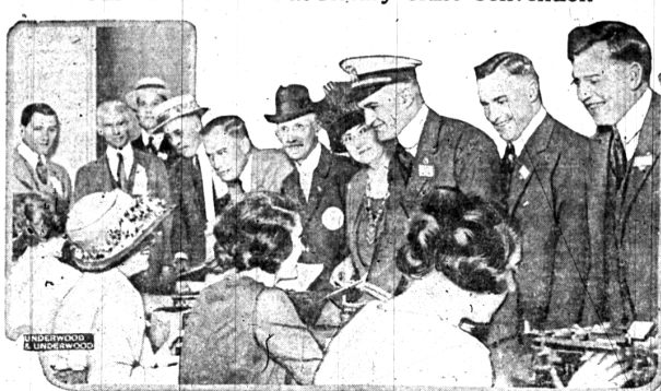
Men of all walks of life, from plumbiers to naval officers and photographers to bank presidents, came together in a common cause at the annual international convention of Rotary clubs in Los Angeles.