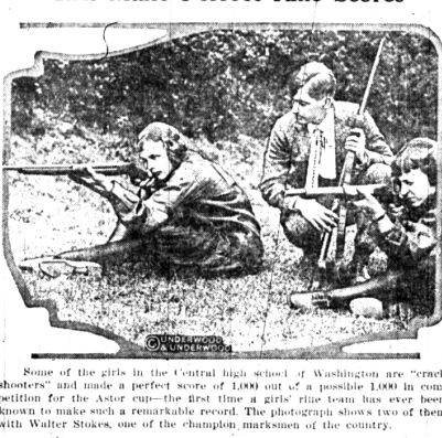
Some of the girls in the central high school of Washington are 'crack shooters' and made a perfect score of 1,000 out of a possible 1,000 in competition for the Astor cup—the first time a girls' rifle team has ever been known to make such a remarkable record.