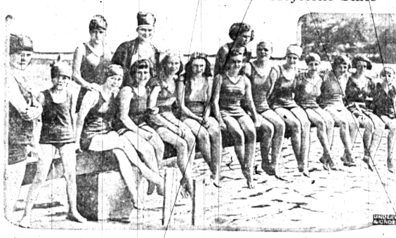
Here are some of the natural beauties of Pennsylvania, gathered at Lafayette. Every one of them is an expert swimmer.