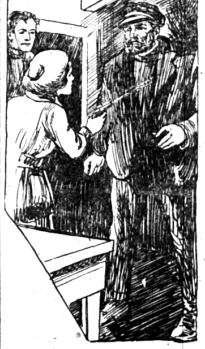
She Seemed to Have Missed, Though Lund Halted, His Mouth Ape, Astounded.

Made by Postum Cereal Co., Inc., Battle Creek, Mich.