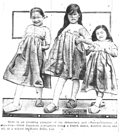
Here is an amusing example of the democracy and cosmopolitanism of America—three Japanese youngsters doing a Dutch dance, wooden shoes and all, at a school in Monte Bello, Cal.