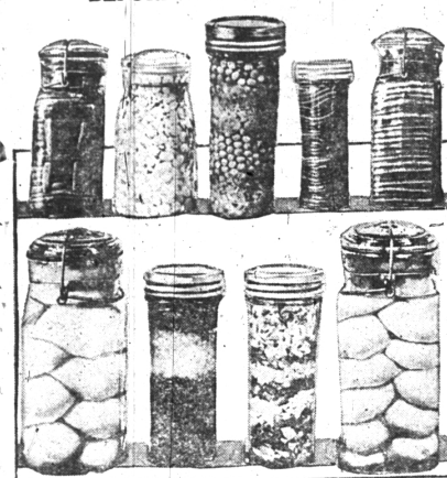
Be Sure Your Rubber Rings Are Good.