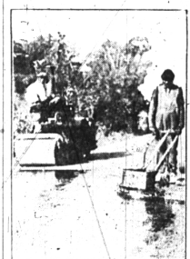
Putting the Finishing Touches on Hard Surface Road.

Now that the roads are to be hard surfaced the tendency is to go to the other extreme in order to save taxes for paving. We must look ahead. If we put down a paving that will last fifteen or twenty years, we must estimate if possible the amount and kind of traffic it will bear at that time.