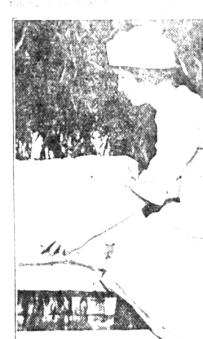
This Club Girl Dries Corn on a Sleeping Shelf Fastened to the Fence.

Careful Preparation Essential. The process of drying the milk sugar requires careful attention. It is essential to use the correct amount of sugar and to dry it at the right temperature. Only one day's work is needed to complete the process.