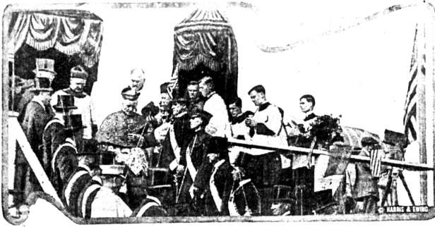
Cardinal Gibbons officiated at the laying of the cornerstone of the Shrine of the Immaculate Conception, Catholic University of America, in Washington. He is here shown descending the steps from the platform. The shrine is to cost $5,000,000.