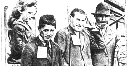
A typical and smiling Russian family at Ellis Island waiting to enter this country. Ellis Island is experiencing the greatest rush of immigrants, and expects to have about 100,000 more in the next few months.