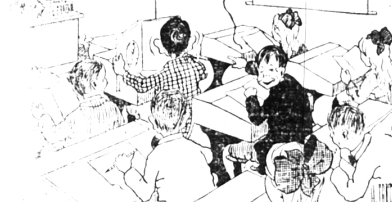
INT. NATIONAL CARICOM CO.