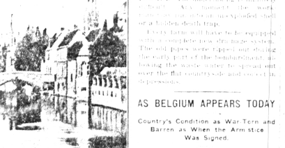
"House Down Near the Church"

The scene is peaceful and beautiful, a stark contrast to the war-torn regions of Belgium. The architecture is traditional and charming, with narrow streets and small houses.