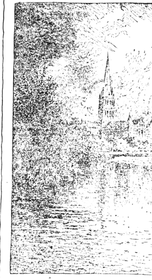
Salisbury Cathedral, From the Neary Lake.

A PHILIP, 12th Earl of Salisbury, Bishop of Old Sarum, was the first to build the cathedral, and his tomb is still in the center of the nave. The tower and spire. Without its spire the cathedral is a mere pile of masonry, with a few architectural details, with the exception of the tower and spire, which are the crowning triumph of English architecture throughout the ages. For over a century the building stood with a low, stunted central tower. Then, in 1220, came the daring conception of raising a tower and spire soaring to a height of more than 400 feet. The boldness of the plan and the danger of its execution have made it a story of the building's history.