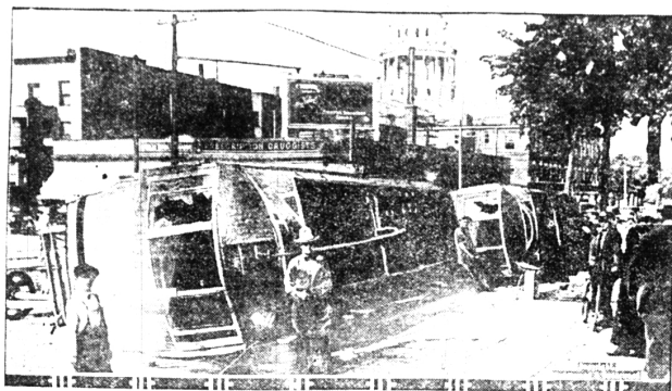
Wrecked and overturned trolley cars in front of the principal streets of Denver during the strike of car men. A number of the cars in the foreground are still on their wheels.