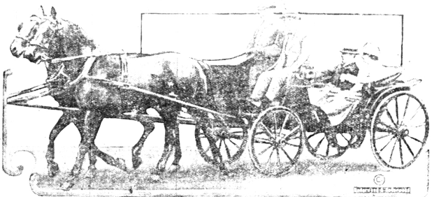
President and Mrs. Wilson, rather surprised Washington on the other day when they appeared in an old-fashioned Victoria drawn by horses.