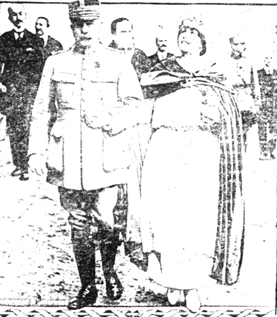
The queen of Roumania has been visiting in Paris, and the photograph shows Marshal Pétain, standing in the foreground, who is one of the Olympic games were in progress.