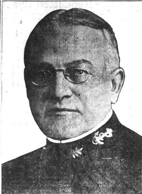
TRUMAN H. NEWBERRY

The Sullivan Meat Co. send out meat from Detroit, weekly, in an immense refrigerator truck, which to all intents and purposes is just as good as a stationary warehouse. The truck supplies Our Cash Market every week (fresh meat and all the other adjuncts connected with the meat business).