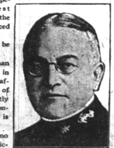
Truman H. Newberry

WHEN the time comes to make a treaty of peace to end this war, we must have in the Senate, the place where treaties are ratified, men of the highest ability, the broadest experience, the best judgment and the most pronounced Americanism. Our future will be in the balance. Every man, woman and child will in some way be affected—each one of us will be directly or indirectly concerned by what is then done. There must be no peace without victory. The victory so dearly won by our boys on the field of battle must be defended and safeguarded at the Council Board of the Nations.