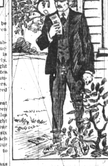
A Number of $20 Bills Were Found in field, formerly a postal clerk on the Santa Fe, has been struck from the docket of the United States district court here.