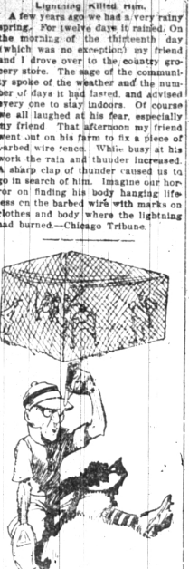
The Tightest Infield You Ever Saw

Careless Omission Costly. A "monkey wrench" mechanic will often omit placing cotter pins or retaining wires in the crown nuts in the motor transmission case or differential housing. Should one of these nuts shake off it will more than likely get into the gear mesh and break up the whole mechanism.