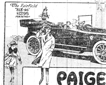
PAIGE The Standard of Value and Quality

Hicks—"I understand that you and Sharp had buried the hatchet, but I heard that you were still getting awfully last night." Nicks—"Oh, so we buried the hatchet all right, but he still uses the hammer."