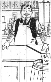
Lightning Killed him. A few years ago we had a very rainy spring. For twelve days it rained. On the morning of the thirteenth day (which was no exception) my friend and I drove over to the country grocery store. The sage of the community spoke of the weather and the number of days it had lasted, and advised every one to stay indoors. Of course we all laughed at his fear, especially my friend. That afternoon my friend went out on his farm to fix a piece of barbed wire fence. While busy at the work the rain and thunder increased. A sharp clap of thunder caused us to go in search of him. Imagine our horror on finding his body hanging lifeless on the barbed wire with marks on his forehead and body where the lightning had burned.—Chicago Tribune

Fleetwood "Six-38" $1050 J. O. B. Detroit