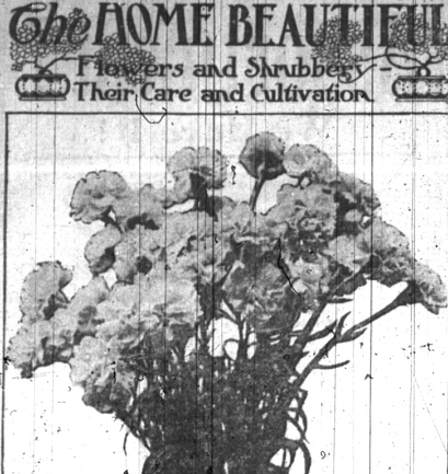
Carnations Are Attractive Flowers in the Garden—Easy to Grow and Beautiful.