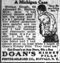
Doan's Kidney Pills