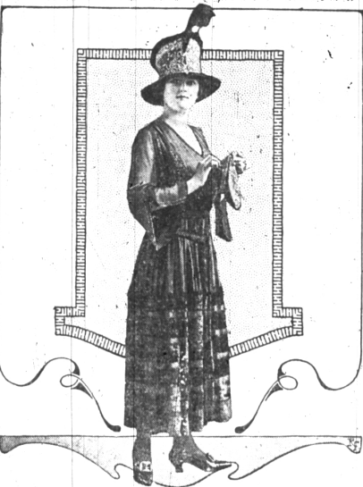
CLASSIC LINES IN AFTERNOON GOWN

All that glitters is not gold or there wouldn't be enough glitter to go round this season. An array of things that sparkle and gleam has invaded the realm of fashion and is established everywhere—except on morning gowns. In company with fur bands and hand embroidery it came and saw and conquered, and now even bonnet gowns are lavishly ornamented with all things. Spangles of gold and silver and in colors, glass and metal beads and jet