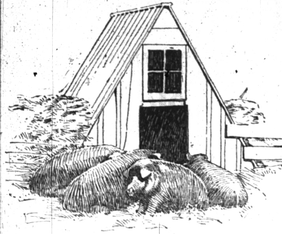
Cheap and Suitable Hog House.

Mother Should Be Given Liberal Supply of Water on First Day and a Start Made on Second With Light Slop—Pigs Begin to Eat When Three Weeks Old.