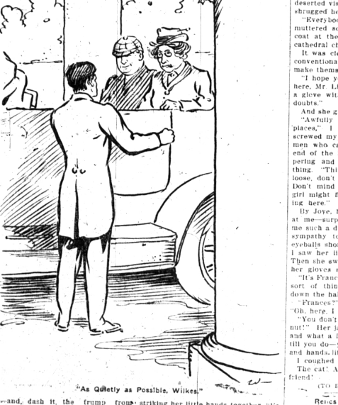
"As Quietly as Possible, Wilkes."

Lightfoot is asked to put on the pajamas. He does so. The pajama man is shocked by the girl's drinking, smoking and playing.