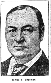
James S. Sherman.