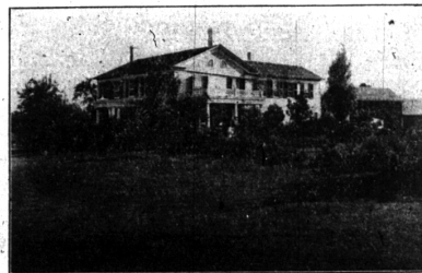
Looking from the North.