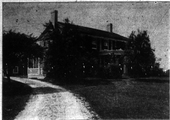
The Wendell Home facing Woodward Avenue.