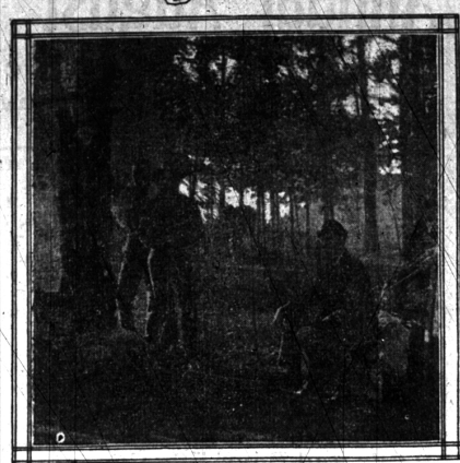
Round Dairy Barn.

In the early days when lumber was cheap, buildings were built of logs, or at least last heavy frames. Upon these conditions the rectangular barn was the one naturally used, and people have followed in the footsteps of their forefathers in continuing this form of barn. The result is that the economy and advantages of the round barn have apparently never been considered.