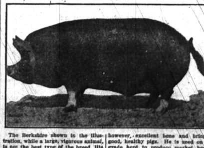
The Berkshire shown in the illustration, while a large, vigorous animal, is not the best type of the breed. His ears are a little coarse and his nose is somewhat too long. He is, however, excellent bone and brings good, healthy pigs. He is used on a grade herd to produce market hogs and gives the best of satisfaction.