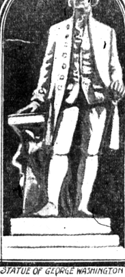
STATUE OF GEORGE WASHINGTON

Washington as president and that also of John Adams took place in what is now known as Congress hall, adjoining the state house to the north, which was not built until 1753. It was here that congress received the news of the death of Washington.