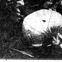
A Couple of Dry Land Pumpkins.

Among all varieties grown so far the Turkey Red is the highest yielding. The average for all years of the different farms is 35.7 bushels per acre. At the Rosebud county sub-station the crop on the plot of Turkey Red was 58.17 bushels in addition to its