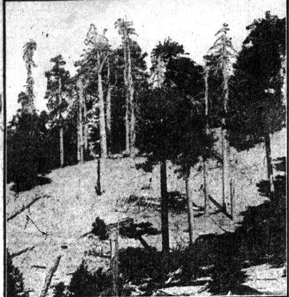
Logged, Burned and Grazed Slope.

Stockmen throughout the west will be gratified to learn that Uncle Sam is studying means for using sheep to regenerate overgrazed ranges. Unique experiments now being conducted by the United States Forest Service at the experiment station within the Wallawa National Forest, in northeastern Oregon demonstrate that the grazing of sheep under proper restrictions is an important factor in the work of reseeded overgrazed ranges.