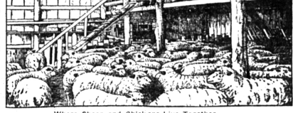
Where Sheep and Chickens Live Together.

As a rule, when you are busy with one you have very little to do with the other, and the sheep are certainly a great help to the hens, just as when they are housed together, as the animal heat from the sheep keeps the hens warm at night.