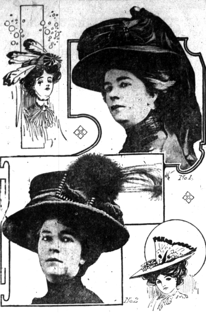
By JULIA BOTTOMLEY.

TWO lovely examples of mourning hats are pictured here made of the two materials most favored for mourning wear, crepe and silk grenadine.