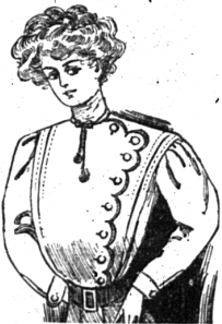
Simple waist of white motor cloth, with pale blue scallops, embroidered at the left side.

A New Material. Half the people who buy and sell don't know the names of the most valuable materials on the counters. Possibly they haven't any names. They are turned out for beauty and comfort, and they certainly have these. One of the attractive evening fabrics invented to make directoire gowns worn without petticoats is of corded satin crepe on the outside, and each mere on the inside in a supple weave. It is extra wide, and when cut into an empire gown falls in lovely lines. The cashmere gives it body and keeps it from becoming string-like. It sells at a moderate price, and promises to be very popular.