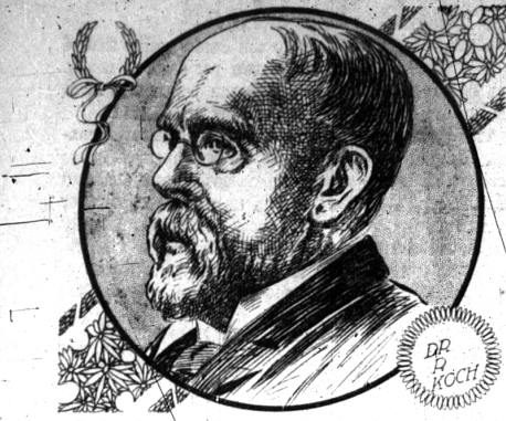
Dr. Robert Koch of Berlin, the German bacteriologist and combatant of tuberculosis and the sleeping sickness of equatorial Africa, is in Japan in a serious condition of health. Friends attribute his condition to overwork.