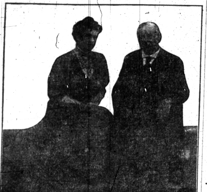
The Fair Form Mistress of the White House and Ex-President Grover Cleveland.

LAKEWOOD, N. J., June 11.—President Grover Cleveland died at his rooms in the Lakewood Hotel, early this morning, from a disease of the stomach. He was 71 years old and the only Ex-President living.