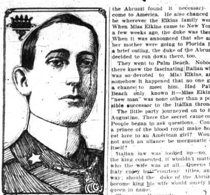
THE DUKE OF THE ABRUZZI

Washington, and his son, the prince of Aosta and his cousin, the duke of Turin, and the count of Turin, and the duke of the Abruzzi were to be king.